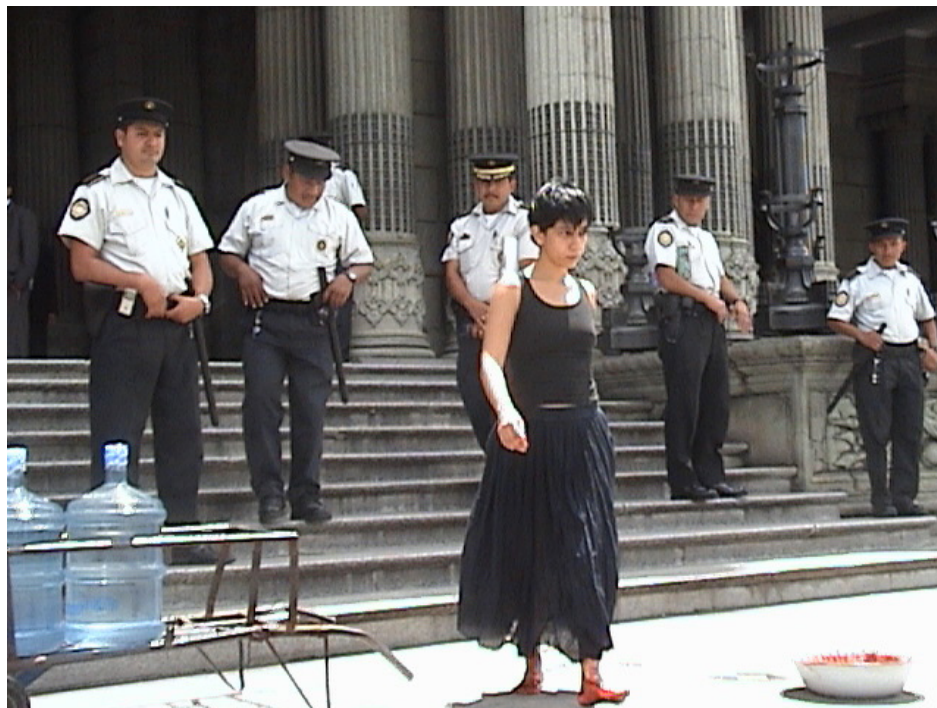
Figure 2. Regina José Galindo, Who can erase the traces? , 2003, © 2003 Regina José Galindo, http://www.reginajosegalindo.com/

when images of war circulate, they break away from their original contexts and thereby make recognizable what was previously unrecognized or misrecognized. Though Galindo's work is not commonly viewed as being about war, she often reframes scenes from Guatemala's civil war in ways that connect it to the ongoing war by other means.